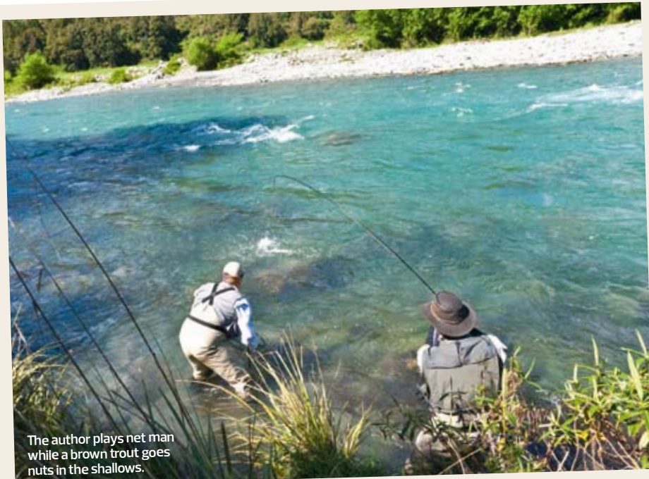
The author plays net man while a brown trout goes nuts in the shallows.