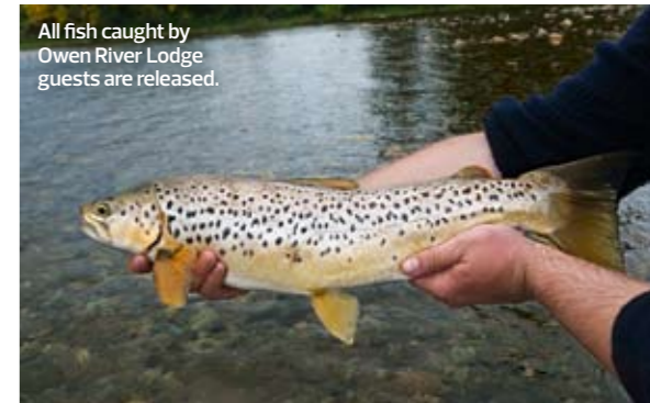
All fish caught by Owen River Lodge guests are released.

Thanks to Tourism New Zealand, too, for their assistance in organising Modern Fishing's travel.