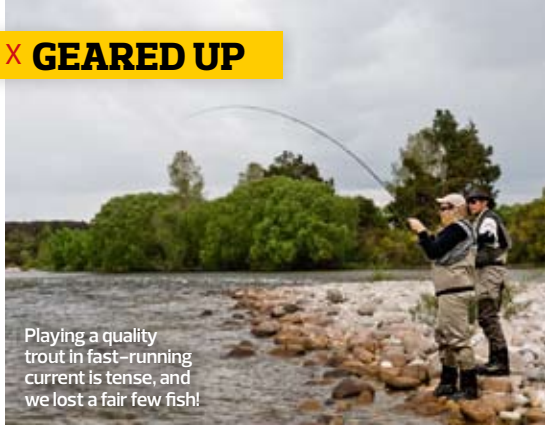
Playing a quality trout in fast-running current is tense, and we lost a fair few fish!

Owen River Lodge can supply most of the gear you'll need, including quality waders, wading boots and an abundance of local flies. One of the symptoms of a fishing addiction though, is the compulsive acquisition of gear. Most anglers will come stocked with gear of their own. We took: