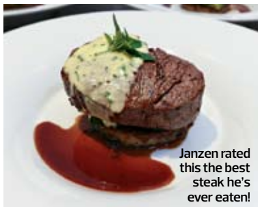
Janzen rated this the best steak he's ever eaten!