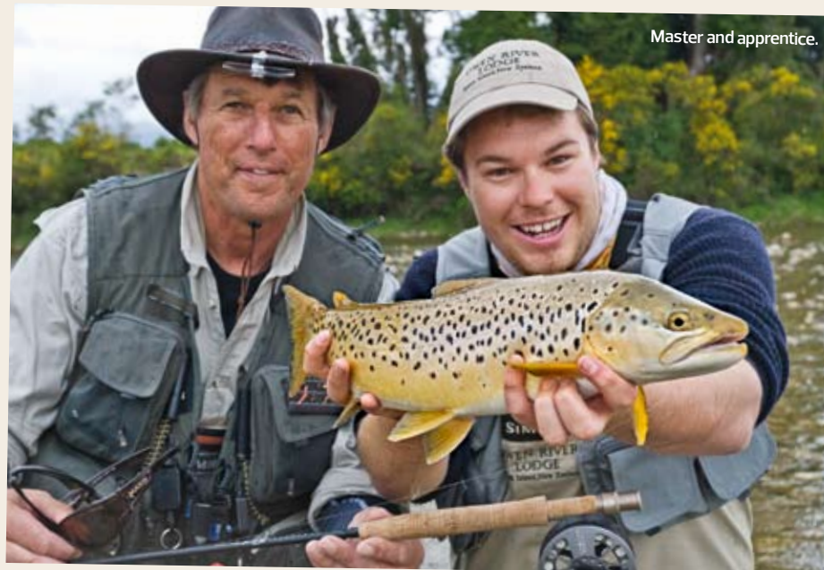
Master and apprentice.

to hook-up and stay connected. I chase my fish downstream and after a dogged fight, manage to land my best fish of the trip. I am stoked, but it's not fair.