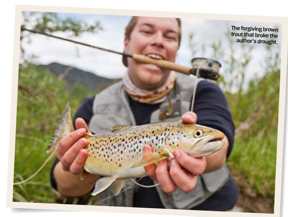
The forgiving brown trout that broke the author's drought.