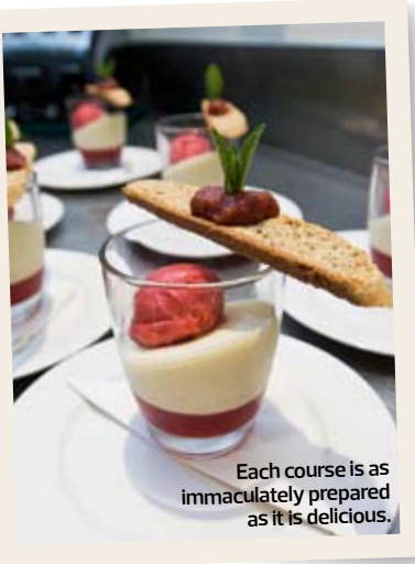
Each course is as immaculately prepared as it is delicious.

I feel like the biggest arsehole in New Zealand when I steal his idea and cast into the same channel, and manage