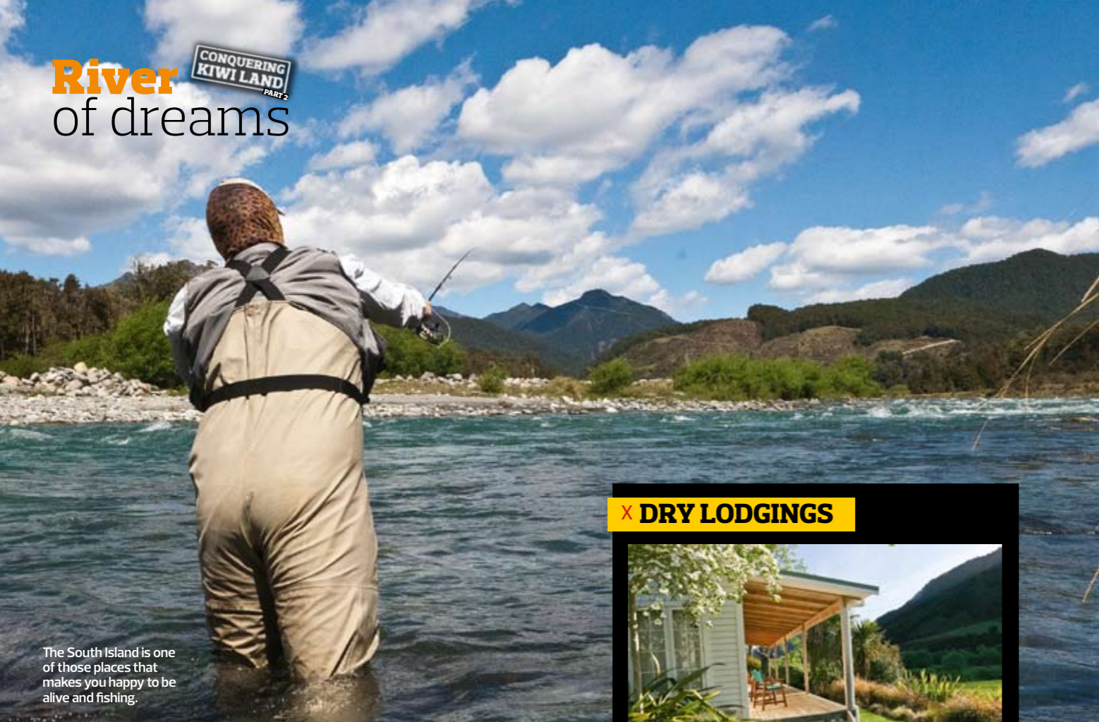
The South Island is one of those places that makes you happy to be alive and fishing.

though the range of rivers and streams available within an hour's drive of the lodge is huge, and the conditions, surroundings and level of experience required to fish them are all taken into consideration by the local guides before each trip.