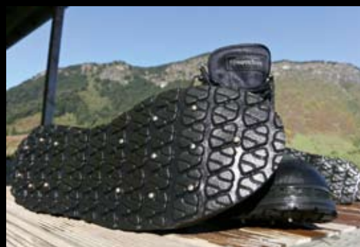
Prancing around like a mentally challenged goose: spreads didymo.