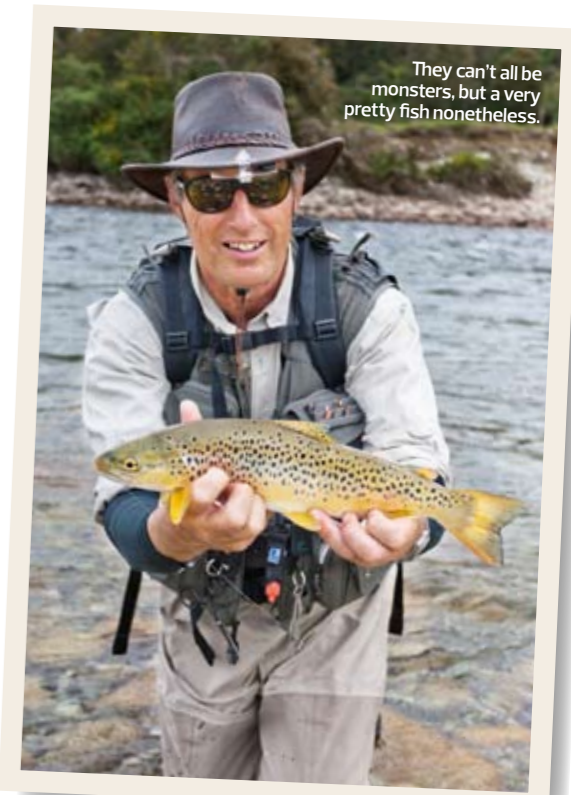
They can't all be monsters, but a very pretty fish nonetheless.

of Dutch heritage who has been fishing the region for more than 20 years, and looks like a fly-fishing Paul Hogan.