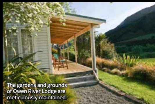
The gardens and grounds of Owen River Lodge are meticulously maintained.