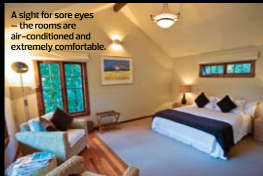
A sight for sore eyes – the rooms are air-conditioned and extremely comfortable.

The product of perfect planning and foresight by Felix, Owen River Lodge is an incredible place. The care and thought that has gone into its design and lay-out, as well as the continuing care and thought that goes into the treatment of its guests and the fishing experience they will have, are to be commended. If you're looking to cast to some seriously big and smart brown trout, while being pampered with great food, massages, beautiful rooms and great company, check it out. It's an environmentally friendly lodge that takes great care to reduce its impact and caters to groups, couples, families and individual anglers.